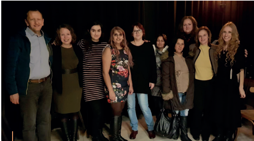
Cesta von at the December event with donors in Klub pod lampou