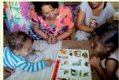
Beginning of lessons in the homes