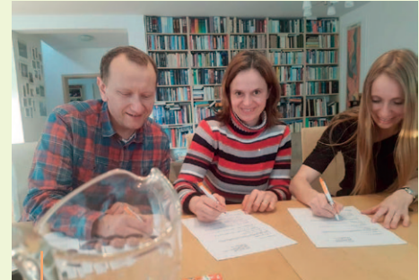
Signing of the founding documents of Cesta von

December — fundraising initiatives organized by ESET and at the YPO event